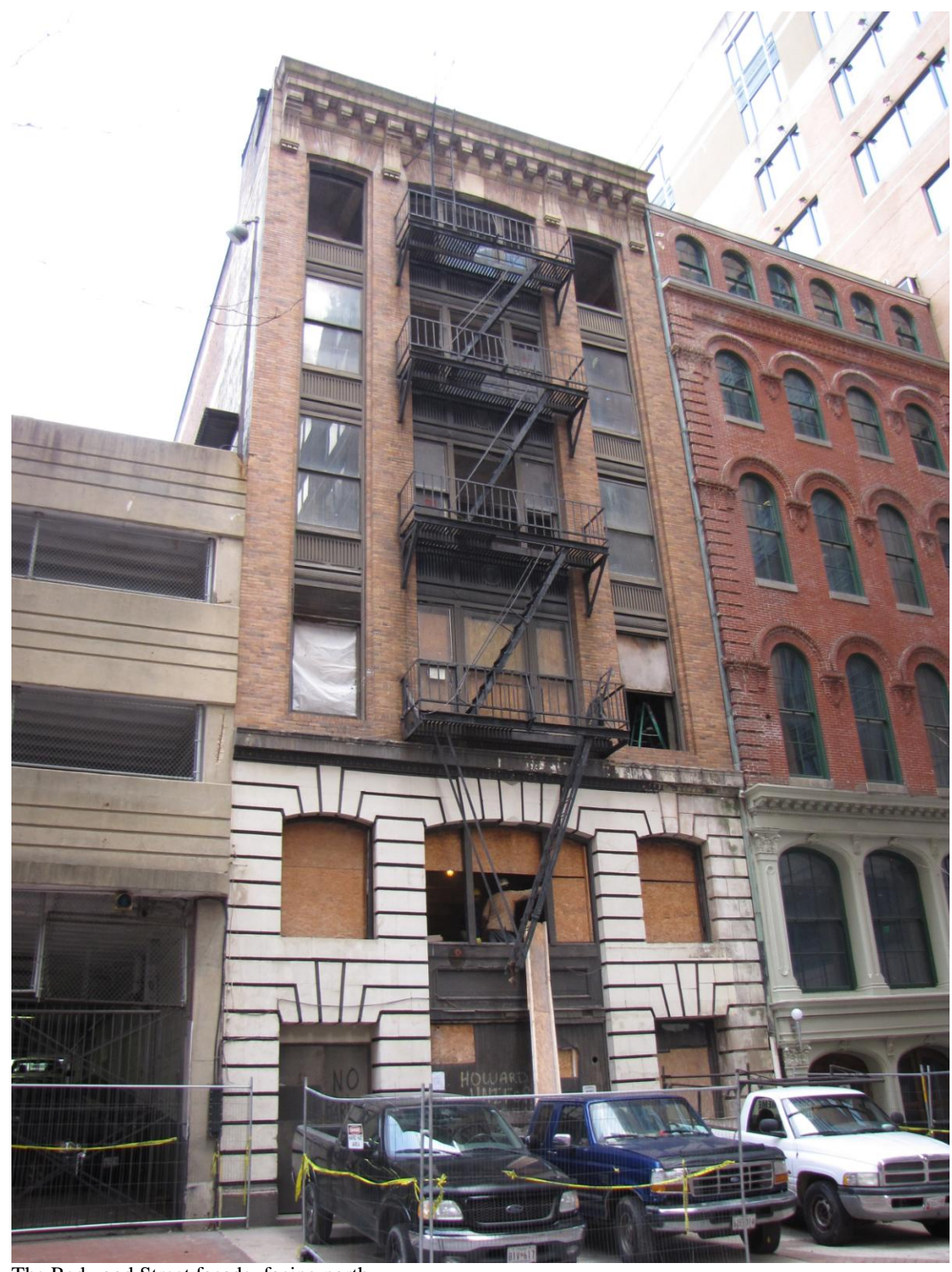
The Redwood Street façade, facing north.