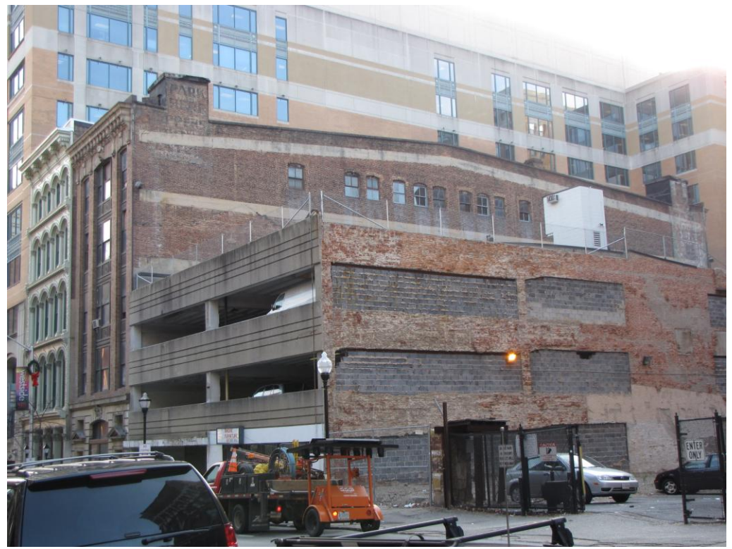
The W. Baltimore St. façade of the building is located just to the left of the parking deck; the entire length of the building is visible.