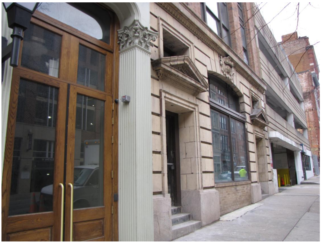
The façade of the building on the streetscape; facing west on W. Baltimore Street.