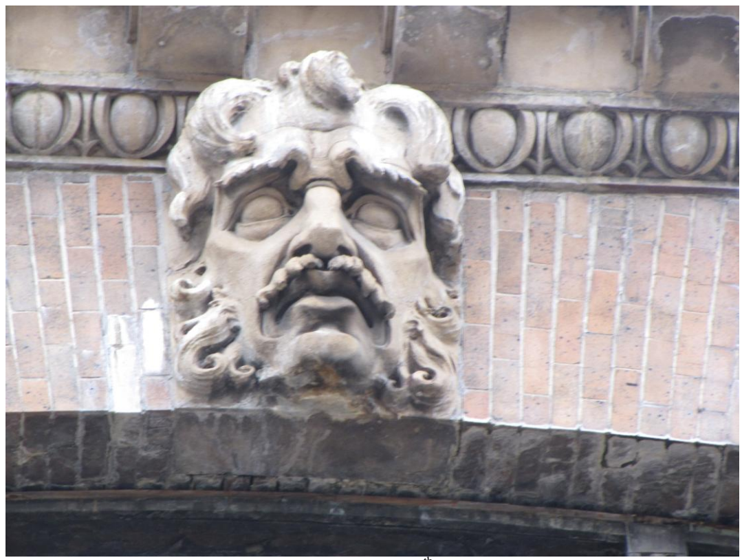
The human face gracing the keystone above the central 5<sup>th</sup> floor window may depict Lawrence Turnbull in a Greco-Roman style.