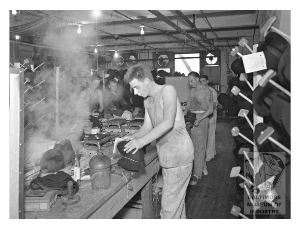
"Interior view showing workers making hats at the Berne Hat Company located on West Baltimore Street"