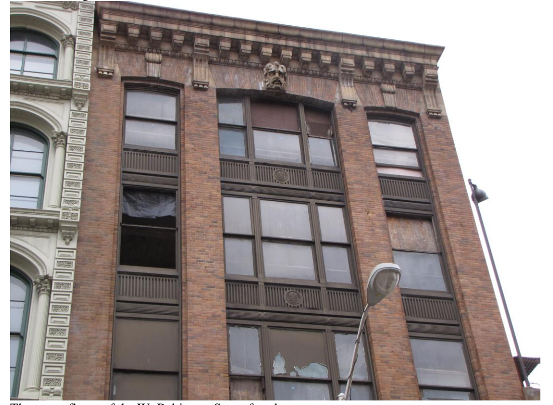
The upper floors of the W. Baltimore Street façade.