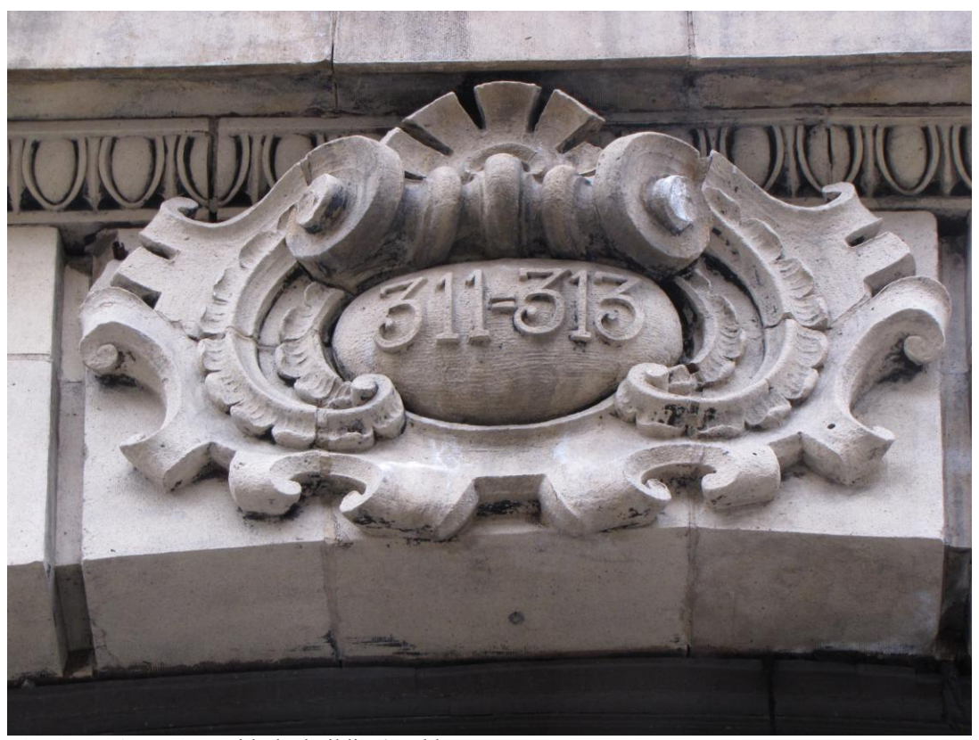
The decorative volute with the building's address.